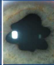
Uveitis and Immunological Disorders