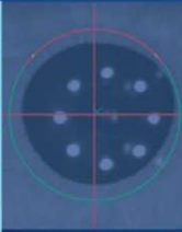
Cataract and Refractive Surgery