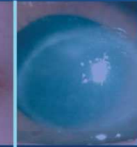
Cornea and External Eye Disease