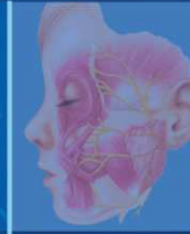
Oculoplastics and Orbit