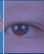
Pediatric Ophthalmology, Neuro- ophthalmology, Genetics